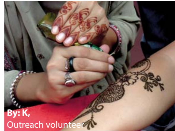
By: K, Outreach volunteer